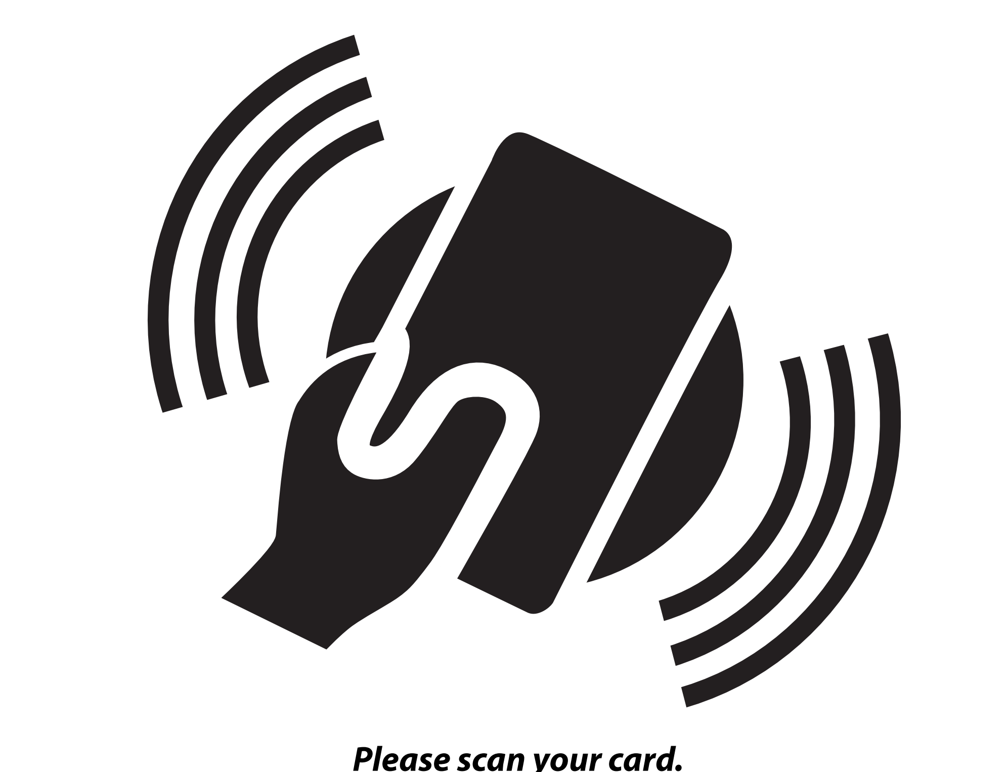
Please scan your card.